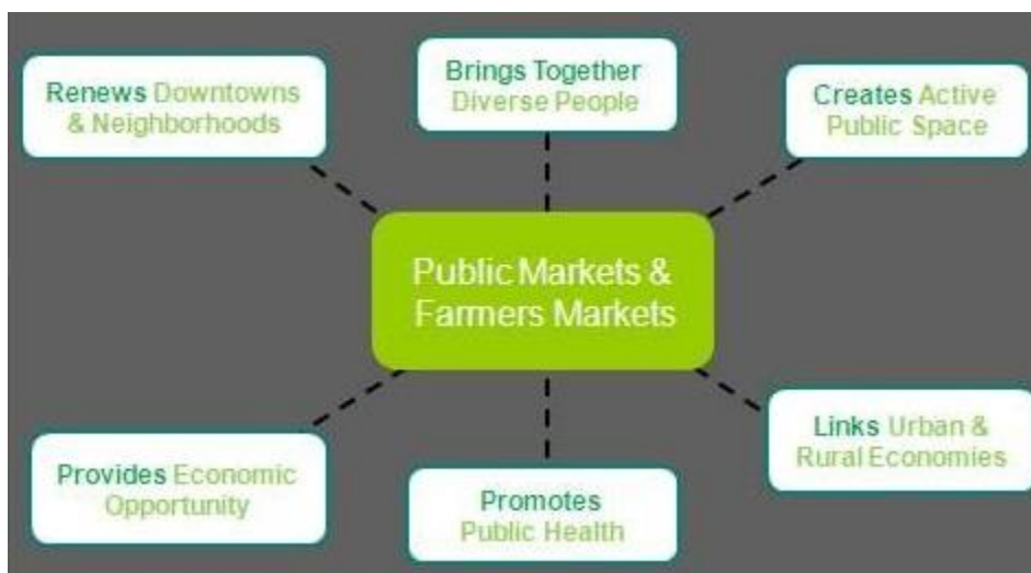
Figure 2: Benefits of Urban Market(B. J. Singh 2011)