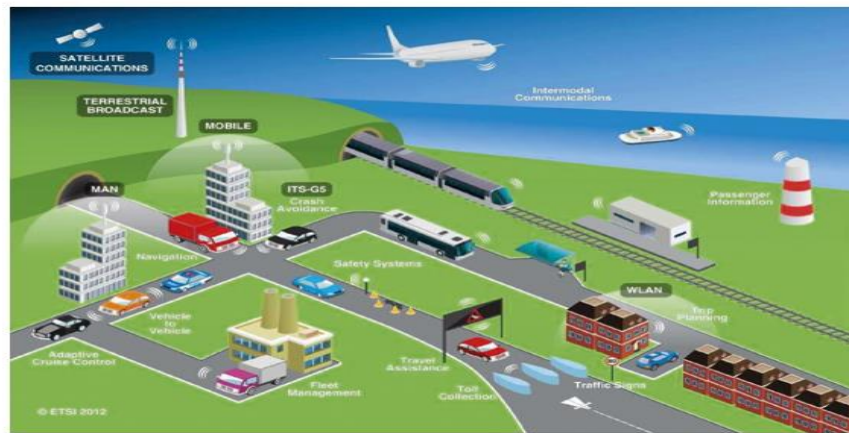
Figure: Traffic control optimization (Source: Elsagheer et. al. 2021)

The Intelligent Traffic Management System's core competency is its capacity to recognize congestion locations and react dynamically. The technology identifies regions where traffic bottlenecks are expected to arise by examining the real-time traffic data gathered using Computer Vision. These congested places may include congested intersections, freeway on-ramps, or zones with a high volume of pedestrian traffic. With this knowledge, the system starts dynamic lane assignment and traffic signal timing modifications.