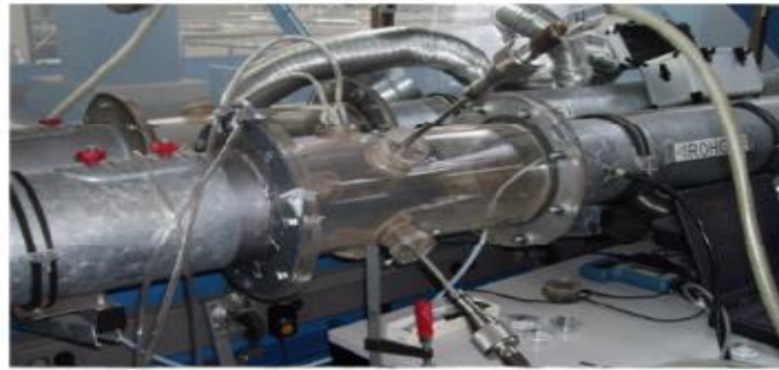
Metering box (including probes), tube diameter 100 m